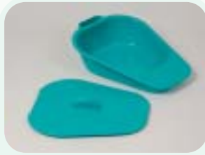
Selina Super slipper pan with lid Size 335mm x 245mm