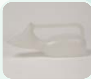
Cygnet female bottle Size 1000ml