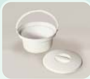
Traditional round commode bucket with lid Size 259mm x 259mm x 144mm