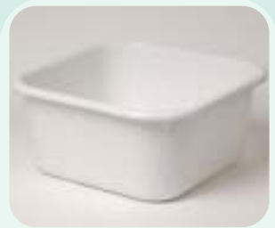
Square commode pot Size 335mm x 335mm x 155mm