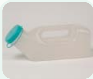
Topper male bottle with lid Size 1200ml