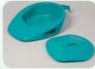
Favorit Fracture-Pan with lid Size 449mm x 309mm x 99mm