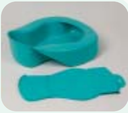
Vector bedpan with lid Size 355mm x 308mm x 108mm